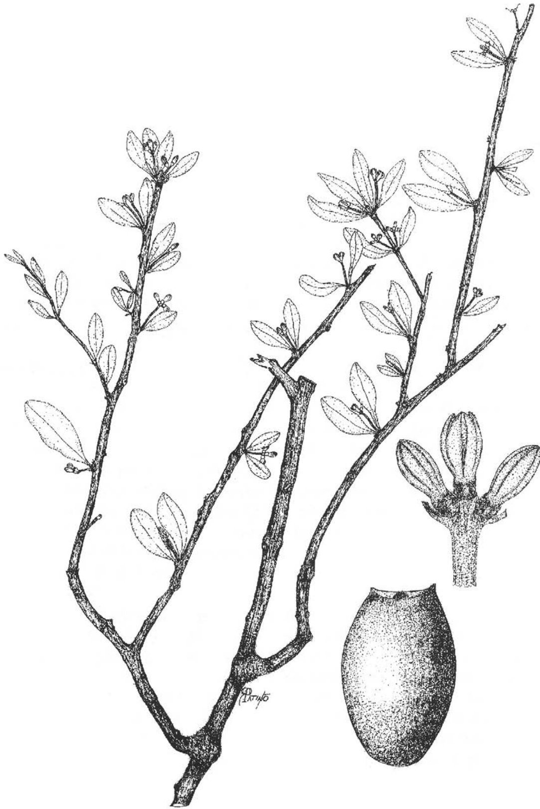
Fig. 1. Cladocolea oligantha (Standl. & Steyer.) Kuijt. A. Flower (J.A. Machuca 6543) (XAL). B. Fruit M. Cházaro B. 6482 (IEB).