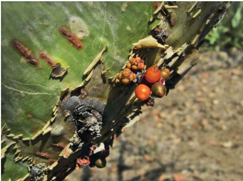
Phoradendron perredactum from Morelos.